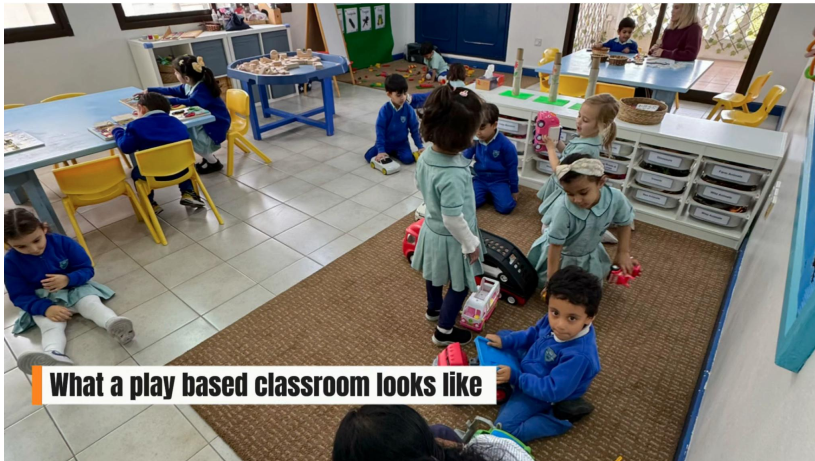
What a play based classroom looks like